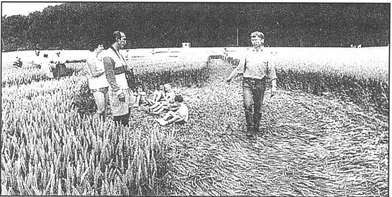
1. Scene at the site

bered below as 32 and 38, so it seems clear that it is extracted from a book or brochure, and not from a newspaper. G.C.